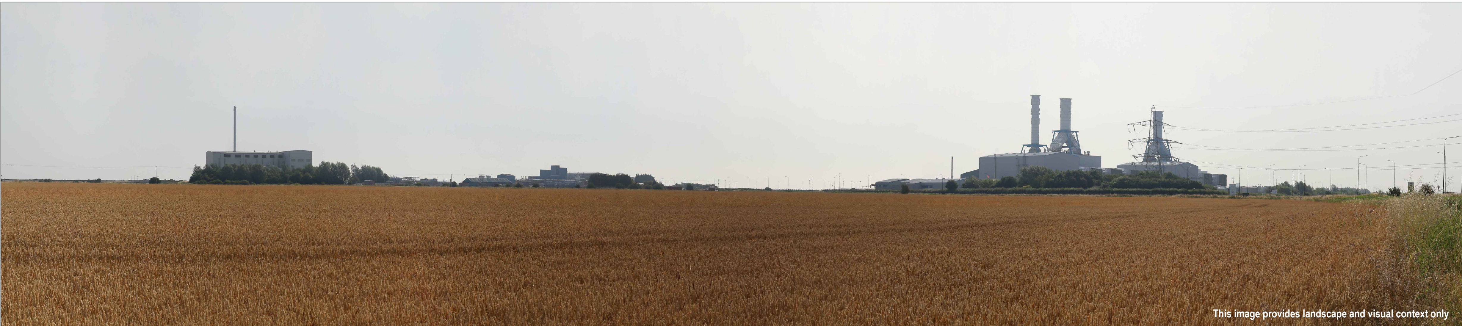
This image provides landscape and visual context only

Filename: \\UK\DS2\PPFS\W001\LE_PROJECTS\NEWPROJ\60580855 - PROJECT KOALA AKA SHBECCAD_GIS\DRAWINGS\FIGURE 11.15-11.18 PHOTOMONTAGE ES.DWG Last saved by: LIZZIE BUSHBY Last Plotted: 2020-03-30